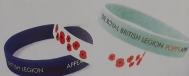
Silicon wristband - Suggested Donation: £1.00