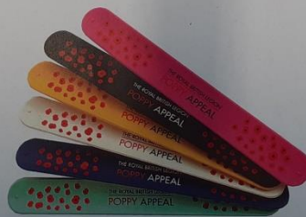
Snap band - Suggested Donation: £1.50