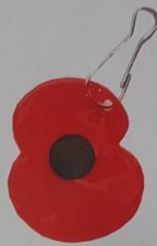
Reflector - Suggested Donation: 50p